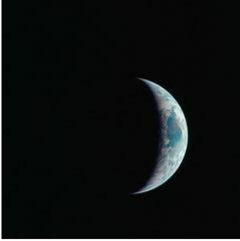
view of Earth, 21 July 1969

The Moon is about 250 000 miles away from Earth. If you travelled there by car without stopping it would take about 130 days. In a rocket it would take about 13 hours.